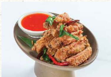
Fried chicken wing