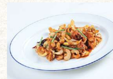
Chicken with cashew nuts