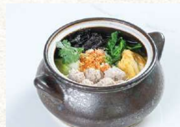
Clear soup with minced pork