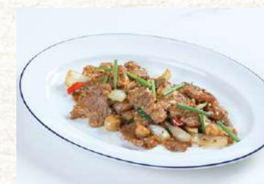
Beef with oyster sauce