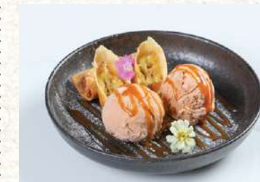
Banana spring roll with Thai tea ice cream