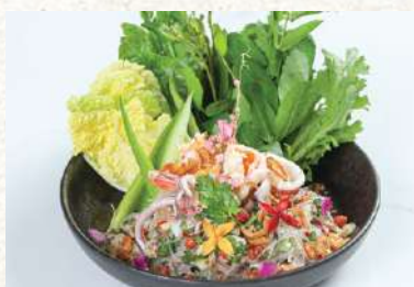
Spicy & sour glass noodles salad