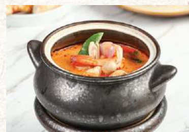
Tom Yum Goong