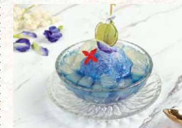
Aloe vera in butterfly pea syrup