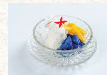
Water chestnut Amethyst