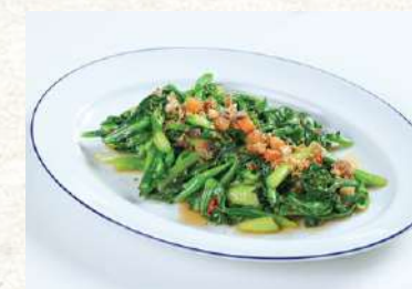
Kale with salted fish