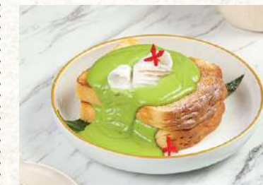
Pandan custard bread