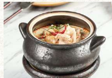
Tom Kha Gai