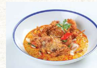
Soft shell crab with curry sauce