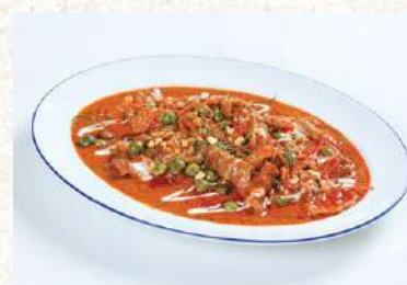
Pork panang curry