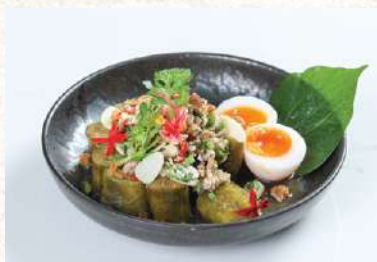
Grilled eggplant salad