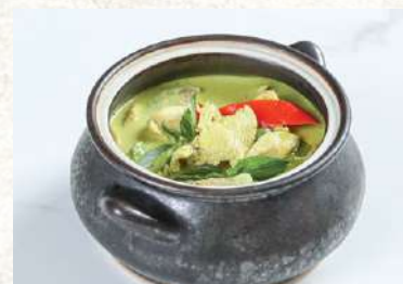
Chicken green curry