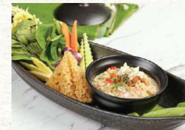
Creamy coconut dip with minced pork and crab meat